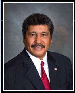
Mayor Fred Pinto